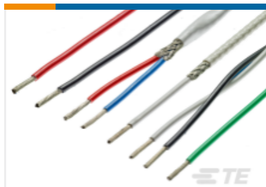
TE Part # 4809893001 100G0111-4.00-0